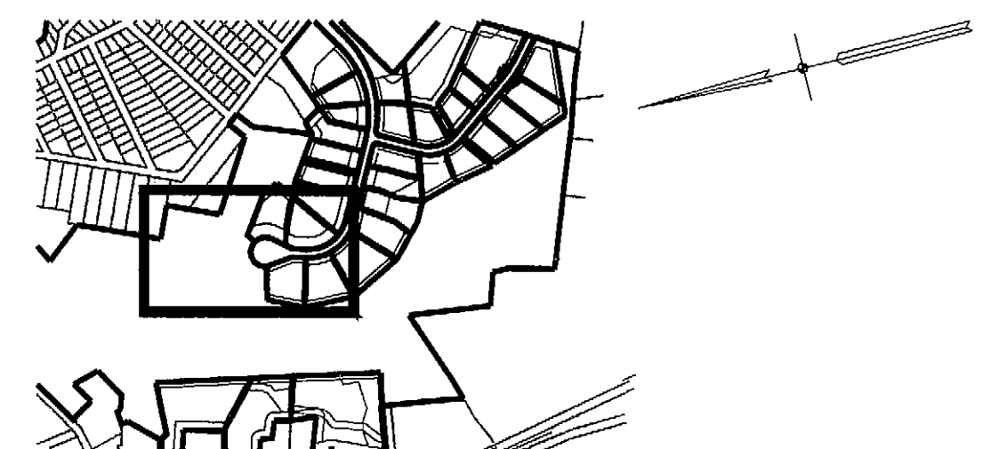
Sheet Index Map 1" = 1,000'