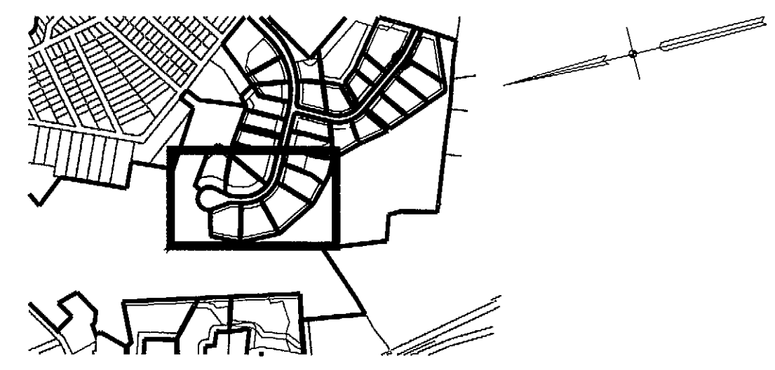
Sheet Index Map 1" = 1,000'

THIS MAP PRODUCED BY ORIGINAL INK DRAWING ON POLY FILM TARBELL, HEINTZ & ASSOC. 1227 BURNSIDE AVE. SUITE 31 EAST HARTFORD CT 06108